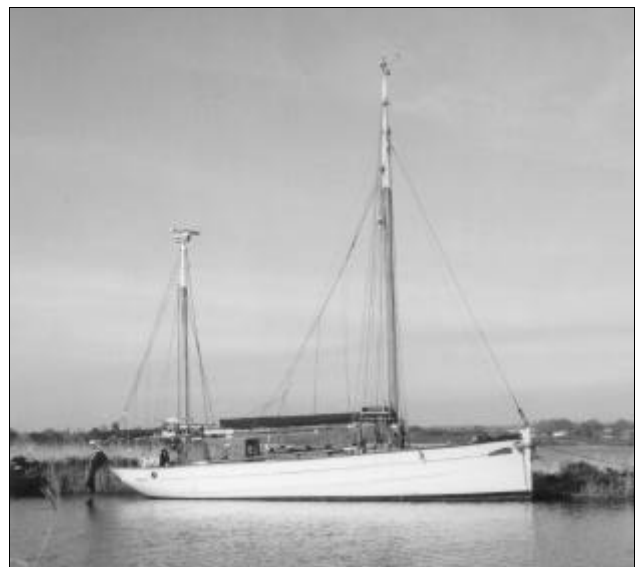
The Angèle Aline

Another vessel that has earned herself a place in the affection of at least three countries is the sailing trawler Angèle Aline built as a "dundee" in Fécamp in 1921 for a French owner near Gravelines. Her designer introduced the 'arriere ronde' type of stern, an (continued on page 2...)